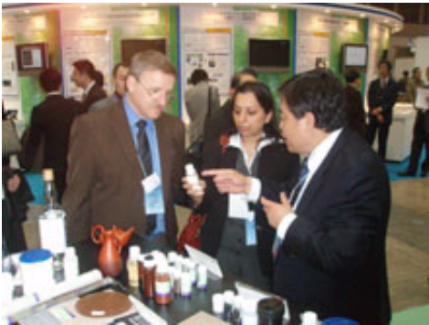
Iranian guests visited our exhibition