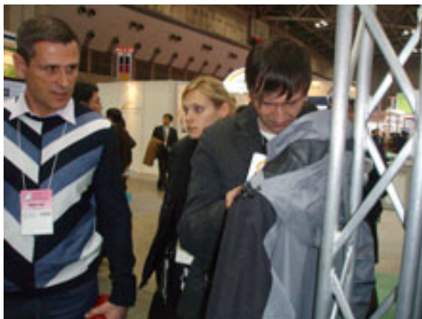
Russian guests visited our exhibition