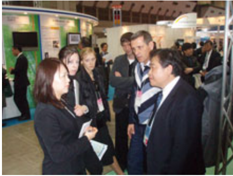
Russian guests visited our exhibition