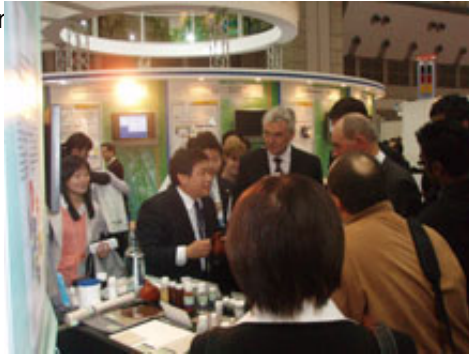
Canadian guests visited our exhibition Â Â Â