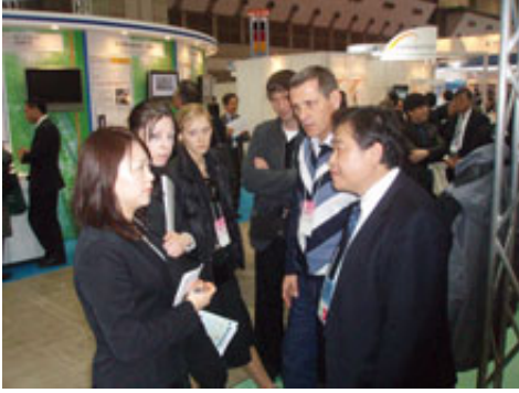
Russian guests visited our exhibition