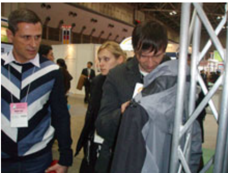
Russian guests visited our exhibition