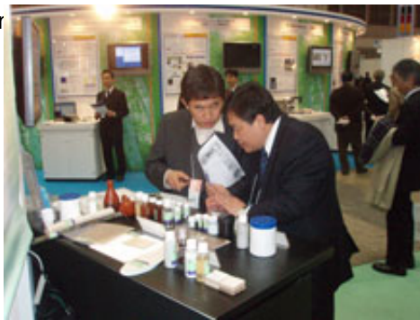
Our colleague introduced our products to a Japanese guest