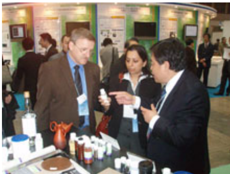
Iranian guests visited our exhibition